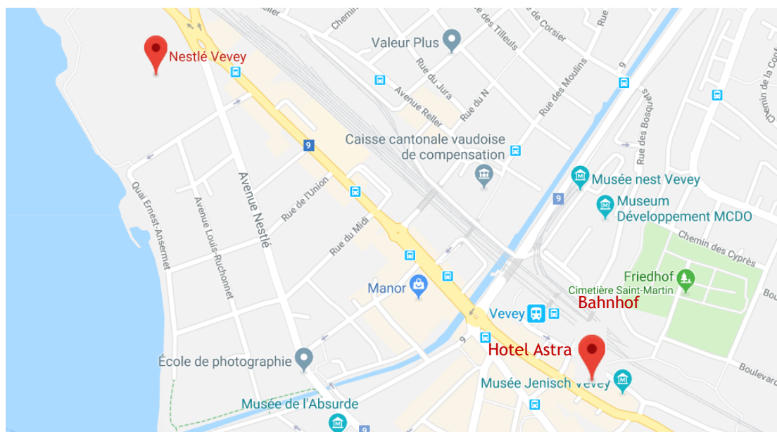
Situation plan Vevey

(with the enclosed form or under www.schweiz-china.ch/form/ )